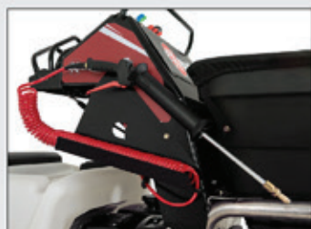
30-FT. EXTENDED HOSE LENGTH WITH HOSE TRAY