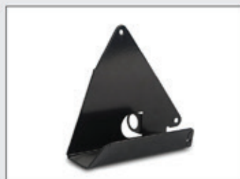
HOSE TRAY — 15 FT.